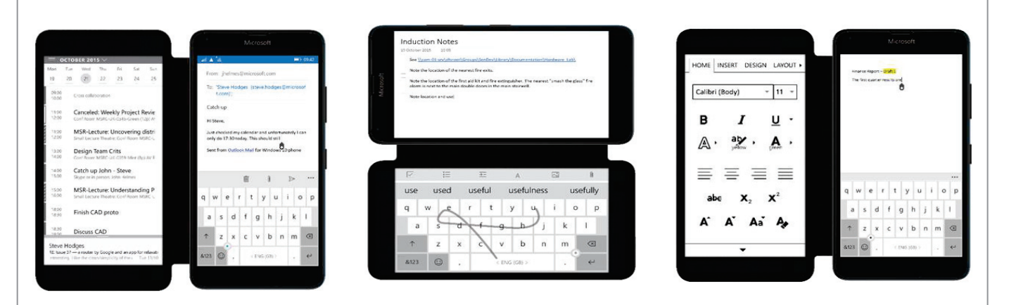
Figure 4 : Our research concept is compatible with "laptop-class" tasks which require larger screen real estate than traditionally available on a smartphone. Examples include cross-referencing while authoring (left), a touch keyboard (middle) and a dual-screen application (right). In each case the e-ink Display Cover is used to extend the interaction surface. Note that these envisioned scenarios would require an e-ink touch overlay which our prototype does not have.