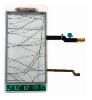
Figure 2 : Between the grey softtouch fabric which forms the display bezel and the Alcantara fabric on the outside of the cover, the e-ink display module and the touch buttons are mounted in a rigid 3D-printed housing to give the cover a uniform thickness (below).

We carried out a series of interviews to learn from users what smartphone tasks they would like to improve. These highlighted a need for more information to be displayed, and for input which didn't compromise so much of the display. Another recurring theme was the desire to access information stored on smartphones more quickly, easily and reliably. At the same time, our participants were unwilling to compromise on formfactor – they didn't want a physically larger phone.