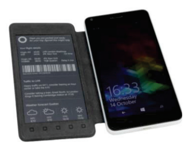
Figure 1: Our working prototype Display Cover is fully integrated with a Lumia 640 smartphone. The cover is less than 3mm thick in total, making it comparable to a regular protective cover.